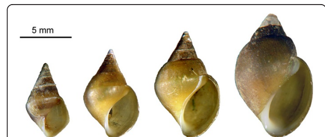
Figure 2 The shells of four individual L. obovata selected from population OF to show a growth series.