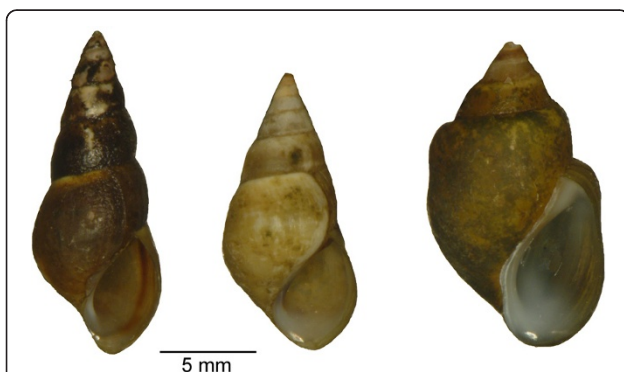
Figure 1 Example shells from the three nominal species. Left to right: Pleurocera semicarinata from Kentucky population SK, Pleurocera livescens from New York population LN, and Lithasia obovata from Indiana/Kentucky population OF.